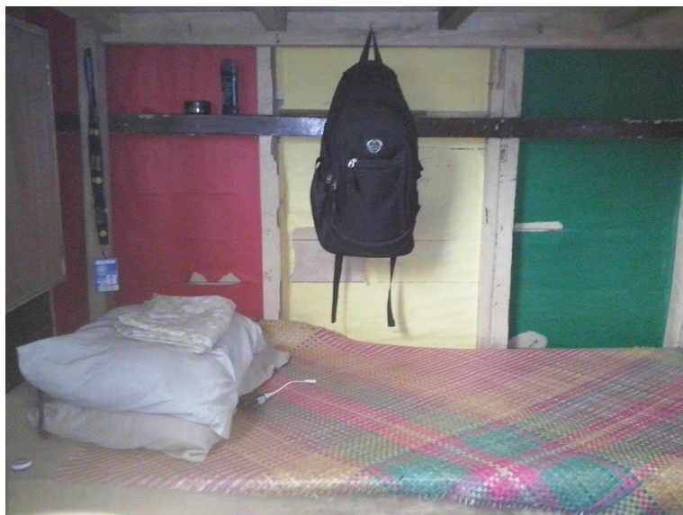
Bedroom in Tagbilaran