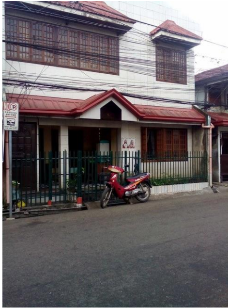
Home in Cebu